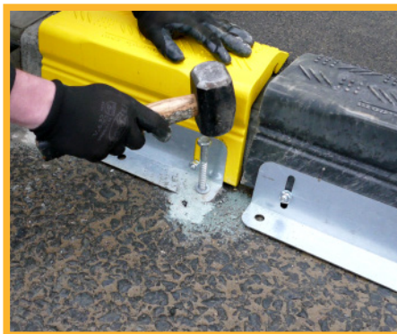
Secure with plastic plugs and 12 x 130mm coachscrews and washers