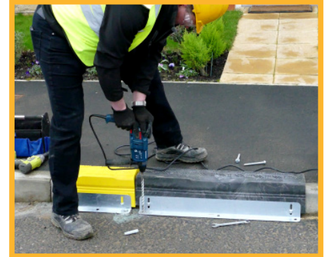
Drill through the mounting bracket with a 14mm bit