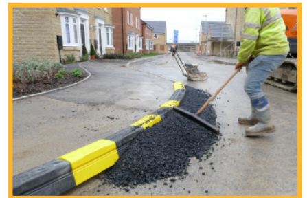
Create the tarmac haunch to suit the size of the narrowest wacker plate available