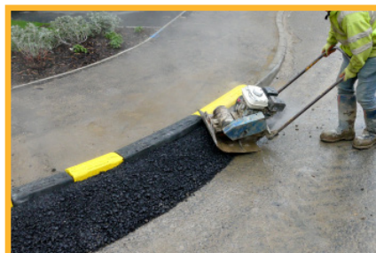
Compact the tarmac firmly