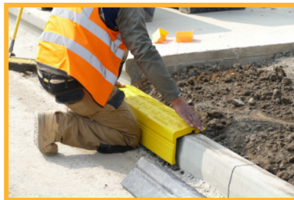
Install KerbGuards straddling kerb joints where possible

When fitting where the pavement has been topcoated, spacers should be clipped under the KerbGuard. Use two spacers per KG400 and three spacers per KG900.