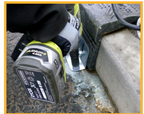
Securely bolt down the mounting bracket then tighten the M10 nuts against the adjusting slots