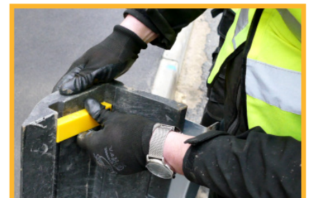
Fit spacers when installing onto topcoated pavements