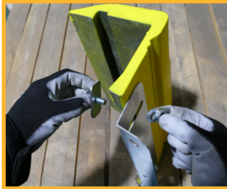
Attach the mounting bracket using a coachbolt and retainer plate, and retain loosely with an M10 nut and washer

Thank you for using KerbGuards. We are always delighted to receive feedback and suggestions, or photos of projects that have used KerbGuards.